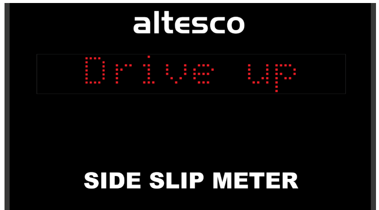
Very compact display SS32: 58 x 33 x 5 cm

Print results direct from the display or connect the display into your network and print via your web browser from any available (network) printer.